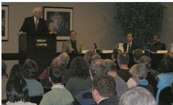
NC Congressman David Price at Public Forum